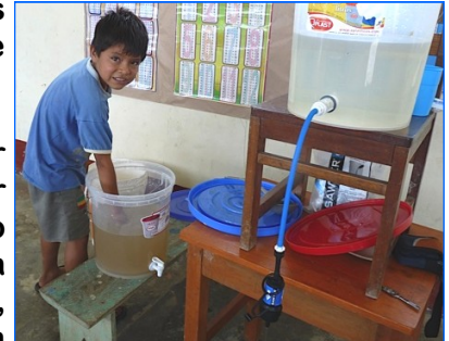
Learning to pretreat the water and use the filter

Sawyer water filters use Hollow Fiber Membranes, a technology developed for kidney dialysis. The filter's pores are so small (0.1 micron) that no harmful bacteria including those which cause Cholera, Typhoid and E. Coli, protozoa, or cysts can get through. The filter attains the highest level of filtration available today, exceeding U.S. EPA standards for drinking water.