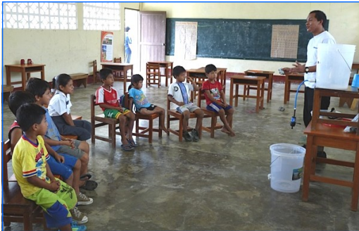
Teaching students and their teacher how to use the Sawyer water filter

According to the World Health Organization, "Water management is a key factor in the global battle to remove the scourge of extreme poverty and to build secure and prosperous lives for hundreds of millions of people in the developing world." For this reason, AaVI has teamed up with CONAPAC and the University of Colorado in a multi-village pilot study using the widely successful Sawyer Household Water Filter. Together, we hope to bring about sustainable change in our adopted village, Nuevo San Juan de Amazonas. In December, AaVI matched dollars raised by donors who supported flood victims to purchase 22 filters for this challenged and hard-working village.