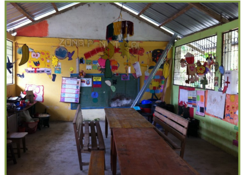
RIGHT: One of the classrooms in the Pumayacu school where AaVI is helping to provide upgrades and supplies