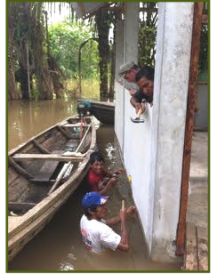
2015 kitchen walls

I recently returned from a 10-day trip to the Peruvian Amazon. While there, I participated in constructing a school kitchen in San Antonio Mirano, a rural village located on a tributary of the Amazon River. This project was made possible with AaVI support as well as funds from the villagers. The Peruvian government offers a food program to communities with school kitchens, so now the children of San Antonio Mirano will receive a nourishing, hot breakfast and lunch during the school year.