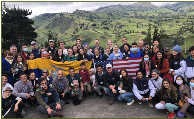
a partnership between many organizations

After completing a day's work in the clinic, team members attended some medical and cultural lectures by local medical staff. We learned about problems related to nutrition, as well as the high infant death rate in Ecuador and cultural beliefs regarding pregnancy and birth.