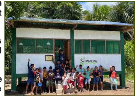
our 7th school kitchen

Through our collaboration with CONAPAC, a non-profit situated in Peru that works closely with these communities, delivery of materials and project supervision was provided. We found the villagers to be hard-working and very invested in the project, even mixing the cement by hand amidst rainforest temperatures!