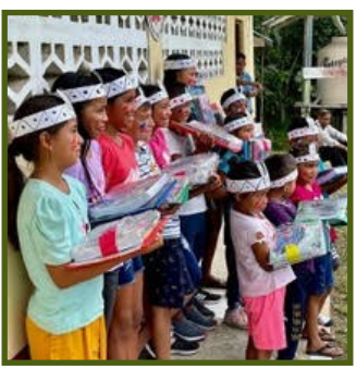
new school supplies

Last month, we delivered school supplies to San Luis, a community in which we previously funded an economic development agribusiness. The kids welcomed us with dances, some adults sang solos and the women served us a delicious, hot lunch with at least ten different fruits, four of which I've never seen before!