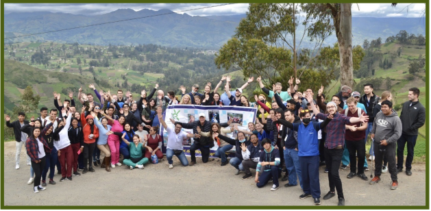
a partnership between many organizations