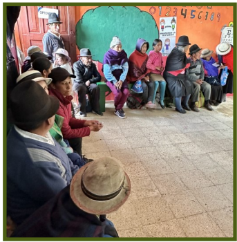
patients waiting in line

A Hand Up not a Handout. AaVI held its first 2023 medical brigade in Ecuador. From 14-18 March we went to Guaranda, Ecuador and attended to 976 patients in coordination with the Hands for Health Foundation which is affiliated with Rocky Vista University of Parker, Colorado. This brigade involved over 80 volunteers which included five dentists, four optometrists, eight general medicine doctors, two audiologists, two radiologists, one OB/GYN doctor, one rheumatologist, one ENT doctor and 20 medical students from the USA. Collaboration was also provided by the University of Bolivar (Guaranda), the local Ministry of Health and office of the mayor. It was a great trip with much medical student teaching, country collaboration, and improved lives of many patients. This was all made possible by generous support from people like YOU! Thank you!