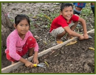
planting camu camu

I also visited our school kitchen project in the village of Ramon Costillo. (The Peruvian government provides meals to all schools with a kitchen). The population of this village is 60-70 people. They have solar panels at each home, some walkway lights and a new water treatment system. The school also has functioning bathrooms! While I was there, we planted camu camu tree saplings in the children's orchard behind the school garden. Students are responsible for the orchard and garden. The fruit will be used to feed the school children and community. Cacao trees planted in 2019 are producing fruit to feed the community and the excess is sold at market. Lemon trees planted in 2021 are adding strong growth and are thriving. Thank you for making these sustainable, life-changing projects possible!